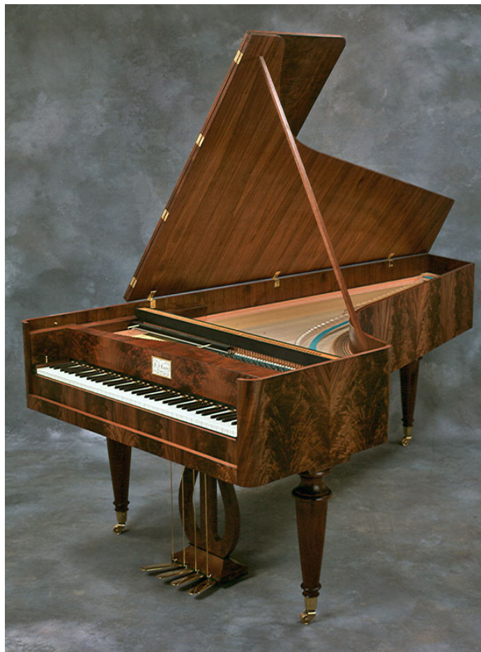
A Graf copy by Rodney Regier similar to Cornell's.

Rodney Regier's Graf piano is built and intended, as the builder himself once proclaimed, to survive in playing condition for several hundreds of years. Upon playing it, one immediately senses its solidity, durability, and overall quality of construction. More than that, however, these more purely mechanical features are matched in equal measure by the instrument's artistic attributes, by its commitment to beauty and complexity of tonal gradation. The Cornell piano is much like the Graf piano that Beethoven owned towards the end of his life, but it represents an earlier model than the Graf that the Schumanns received from the Viennese builder as their wedding present. Regier makes two types of six-octave pianos: a middle-period Graf (of which the Cornell piano is an example) and a later period Graf piano, which in reality is a hybrid of a Graf and a Bösendorfer from the same era. (In the course of his engagement by the Yale Collection of Musical Instruments to rebuild their ca. 1830 Bösendorfer 6½ octave piano, Regier incorporated some of its design into his own recreation.)